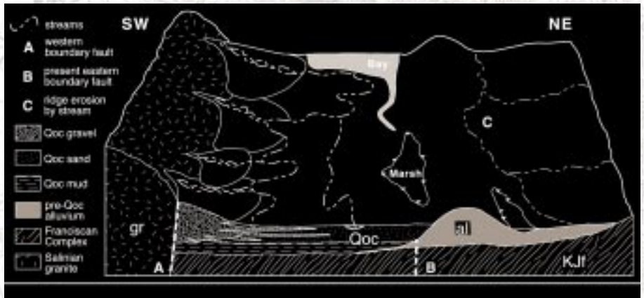
Schematic diagram of the paleogeography of the San Andreas Fault valley south of Tomales Bay.

Above: Marine terraces are used to estimate the rate of vertical uplift of the Point Reyes Peninsula and the timing of its emergence from the sea (ka= thousand years ago). About 330,000 years ago, the Point Reyes Peninsula consisted only of a single small ridge west of the San Andreas Fault. Since then it has been uplifted by faults to become a larger area above water. The white area between the peninsula (shown in darker gray) and the Marin County mainland (shown in gray) is the valley created by the San Andreas Fault.